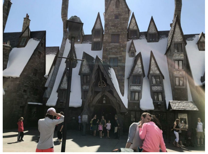
Figure 2 Harry Potter Theme Park

The plot of space can make people feel the existence of space and the significance of space design. The existence of space plot comes from space experience. With the development of space plot, the feeling of space experience is gradually deepened. Space plot and space body bow are interdependent and promote each other. The plot of space does not exist independently, and it needs to be experienced before it can be felt. Without experience, there is no plot unfolding. In the continuous experience, with the direction of plot clues and the in-depth changes of plot, people are brought rich emotional feelings and pleasant feelings. Interior designers need to deeply understand the space plot and the relationship between the space plot and the space experience, so as to analyze and design the space more deeply. For example, the Harry Potter theme park in Universal Studios has created scenes exactly like those in the movies. Not only that, but these scenes also contain the stories in the movies, so that people can participate in them. It's like crossing the movie scenes for fans. This is the experience of spatial plot. As shown in Figure 2.