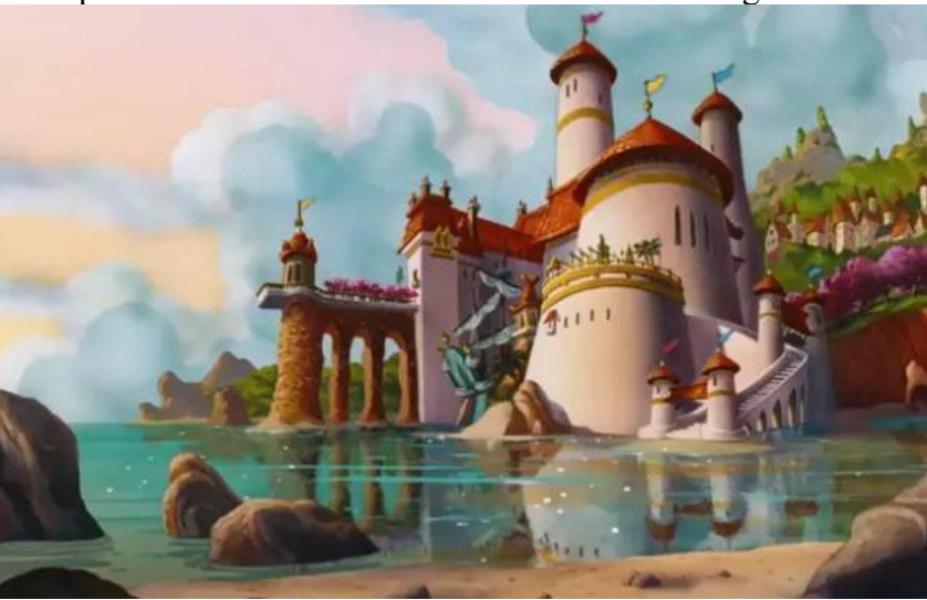
Figure 1 Castle scene in The Little Mermaid

The animation plot develops according to the arrangement of the script and the director, and the scene design evolves with the development of the plot. The design of the scene is story-like, and the changes of the scene are carried out according to the progress of the story. Drama curtain is the concrete manifestation of plot development in a scene, and drama curtain is the background of role performance. The whole story is connected with the scene, plus the performance of the characters. The first thing to consider from the scene design is the characteristics of the times and regions. This requires that when reading the script, it is necessary to extract the characteristics of the times, regional characteristics and history and culture that the script wants to express, as the basis of scene design. Some scenes can combine modern times with history, modern times with science and technology, and some scenes are pure natural landscapes with little sense of the times, which requires fresh and natural style as always. In Hal's room, there are all kinds of beautiful decorations, and the gift also fully shows his love for beauty; In The Little Mermaid, in order to reflect the mermaid role of the protagonist Ai Lier, her bed is designed as a shell, and the activity space is almost in the mermaid palace at the bottom of the sea. As shown in Figure 1.